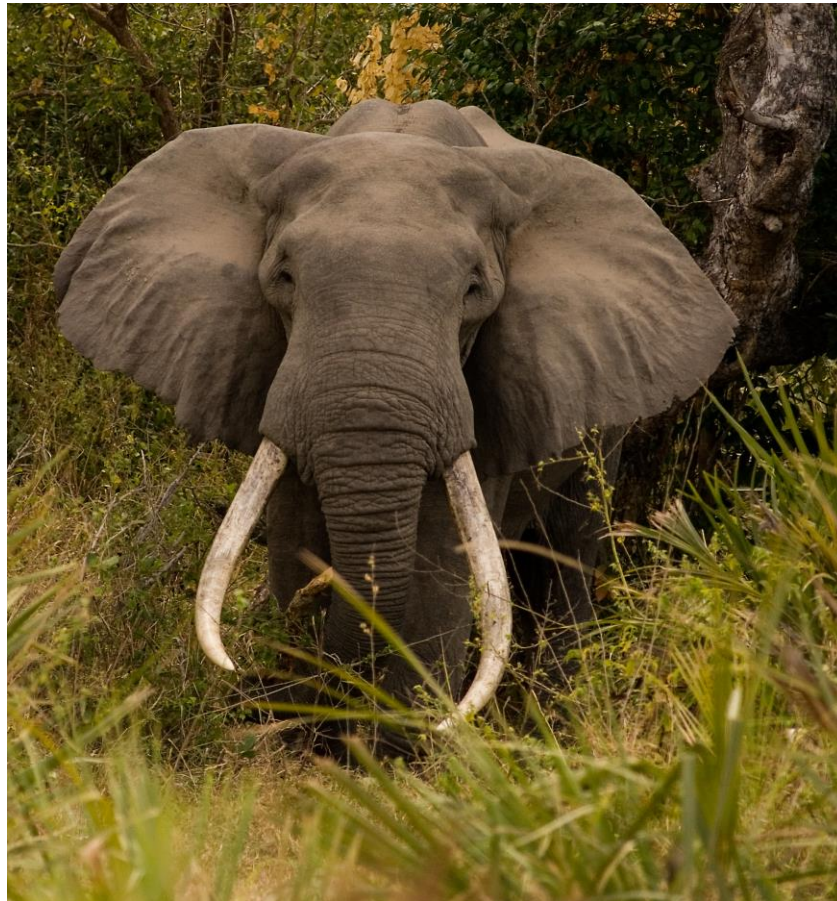
It took around twenty years after the poaching crisis of the 1970s and 1980s for big tuskers to appear again. This photo near today's construction site at Stiegler's Gorge was taken around 2005 by Sean Lues , a tourist guide at the Beho Beho lodge, Selous Game Reserve. The animal was most probably later killed by poachers.

Several large-scale, environmentally destructive projects were also blocked during that time. Previously, the game reserve was totally dependent on meagre funding from the Tanzanian government's general budget but the SCP implemented a scheme that retained fifty percent of the revenues earned by the reserve. Ninety percent of those funds came from sustainable safari hunting which ensured that good conservation practices were implemented.