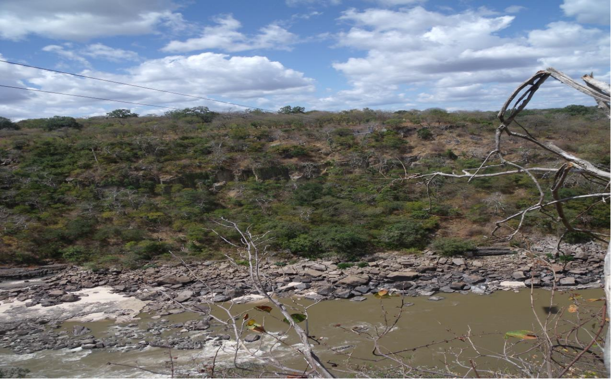
The Gorge with the old Norwegian cable car of the early 1980s

Soon the opposition from scientists at the University of Dar es Salaam grew. Even NORAD staff voiced increasingly criticisms that were aimed at the socio-economic and ecological impacts of the dam. Their concerns centered around health problems, insufficient electricity-needs of the country, negative economics of the dam and technical issues of the construction and the management of the dam that could overburden Tanzania. The World Bank refused to co-finance the project.