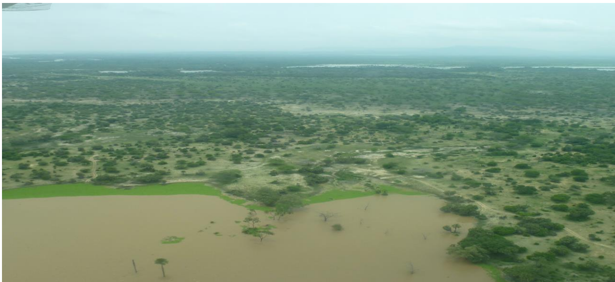
Such wetland underneath the dam will dry out once the dam is in place

The dam is situated in one of Africa's most important protected areas, the Outstanding Universal Value of which was honoured with the prestigious and highly selective status of World Heritage Site. The negative ecological impact of the dam will be enormous. Amongst others it will probably destroy the wetlands consisting of river arms, lakes, swamps and thickets that constitute the "heart" of the reserve and its most important tourist area just downstream of the dam. A reliable and serious assessment of the impacts has not been carried out yet but is urgently required. If the Tanzanian Government continues with the project, the Conference of Parties of the World Heritage Committee will have little choice but to deprive the Selous of its world heritage status. This has happened only three times in the history of the Convention. It will lead to a major international loss of reputation for Tanzania. The national park and game reserve system of Tanzania has been one of the unique features and a unique selling point of the country internationally.