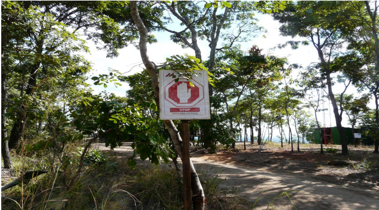
Uranium mine "Mkuya River" in the Southeast of Selous

The deal was basically unavoidable, as millions of dollars had been invested in the mine already, and the point of no return had been transgressed years before. The government had simply created facts and outsmarted the Convention. In order to avoid this for the future, it was agreed during the 36 th Session of the World Heritage Committee in Saint-Petersburg in 2012 that Tanzania would not once again “... undertake any development activities within Selous Game Reserve, and its buffer zone without prior approval of the World Heritage Committee ...”.