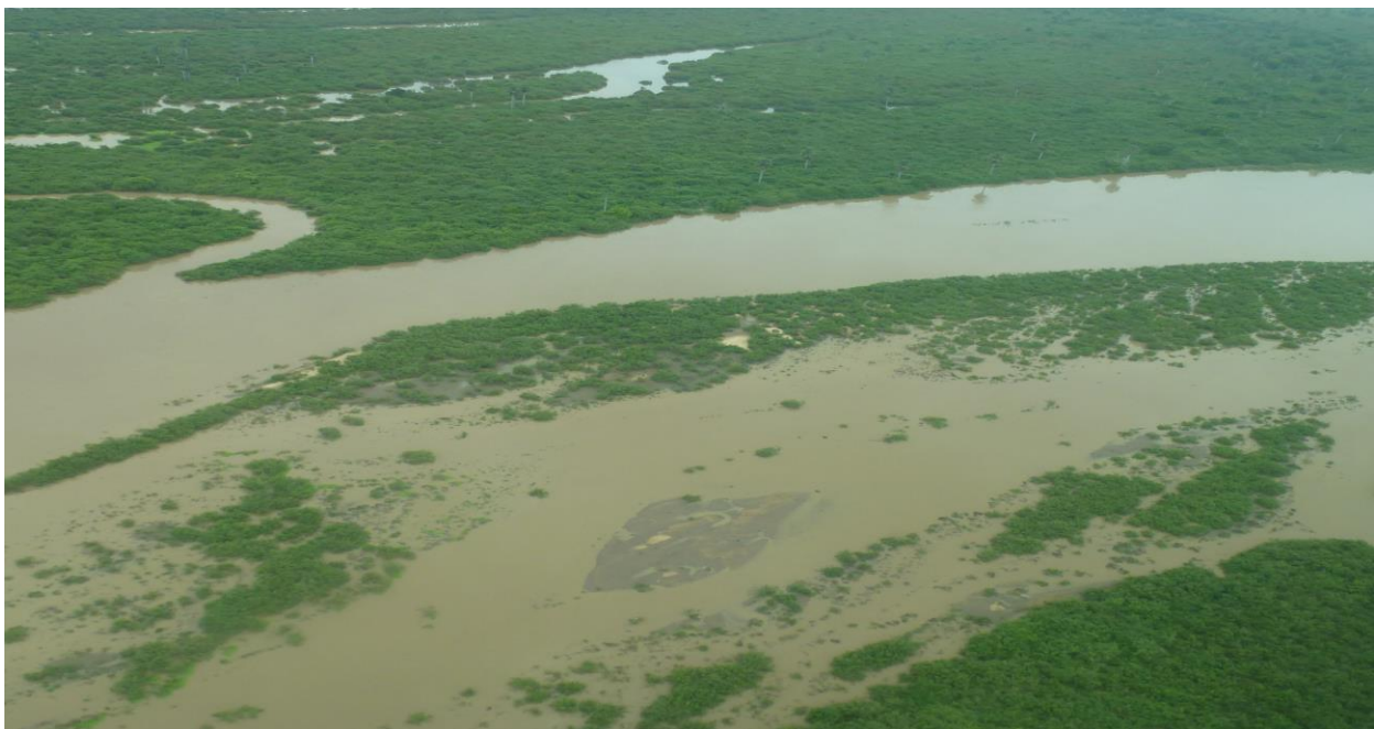
Wetlands beneath the planned dam

Tanzania agreed and signed in order to have the uranium site cut out of the reserve. However, the plan to build the dam was followed up unchanged.