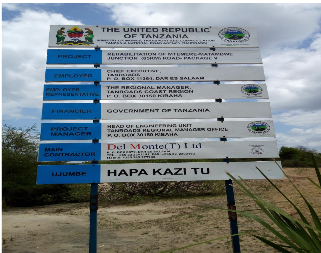
220 km of new access roads are being built

The Tanzanian Government has decided that 1,450 km 2 of forest shall be cleared now. This will affect approximately 2.6 million trees. Authorities expect a revenue of US$ 62 million according to press articles. It would not only be the largest single logging exercise in the world in recent times but would also constitute a significant breach of Tanzanian legislation. As an observer one can ask whether the Tanzanian Government regards itself as being above the law. A tender for logging fell through, but a Chinese logging company has been seen in the area on a reconnaissance mission some months ago. Logging has not started yet.