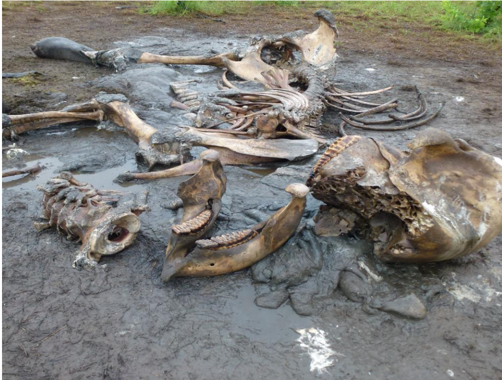
Poached elephant in Selous Game Reserve (2014)

Global seizures showed that the Selous-Niassa ecosystem was the poaching hot spot for savanna elephant for several years. An aerial elephant census in 2013 found that only about 13,000 of the pachyderms had survived in the Selous ecosystem.